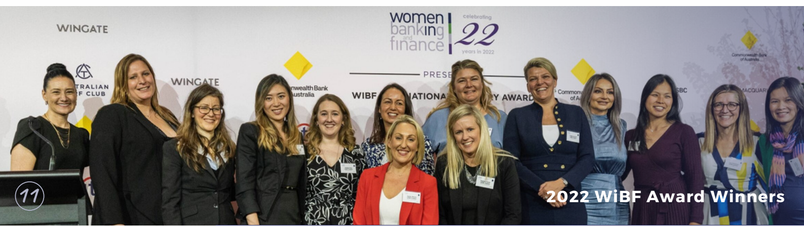
2022 WiBF Award Winners