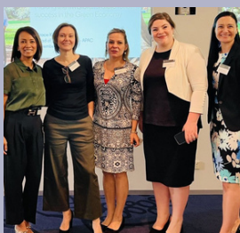
50 Shades of Green – The Green Economy hosted by Macquarie Group 10th November 2022

Over 100 guests gathered in Sydney in November to discuss sustainability, technology, innovation and perhaps one of the most important transformation over the next decade for individuals, businesses, and governments – The Green Economy.