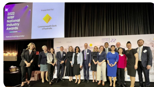
WiBF 2022 Judges and Board