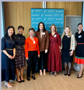
The Future of Banking and Finance – How Far We've Come & What's Ahead 16th September 2022

WiBF and Barrenjoey proudly hosted an all-women panel event for students and graduates in September.