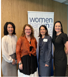
Economic Outlook hosted by ANZ 25th May 2022

WiBF and ANZ hosted the Economic Outlook annual event in May. It was the perfect opportunity to network, chat and share ideas with industry experts.