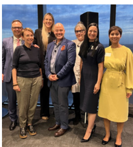
14th Annual Forum hosted by Deutsche Bank 25th October 2022

WiBF would like to thank all the attendees who joined us in October for the 14th Annual Forum hosted by Deutsche Bank.